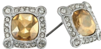
Necklace and earring set