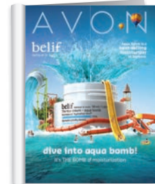
belif: January–December 2020

You can share content about the ads from AvonNow.com, Beauty Buzz and Virtual Sales Meetings. It's the perfect way to get the conversation started and reach new customers!