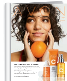
Vitamin C: June 2020

GOOD HOUSEKEEPING Distribution: 4.2M people